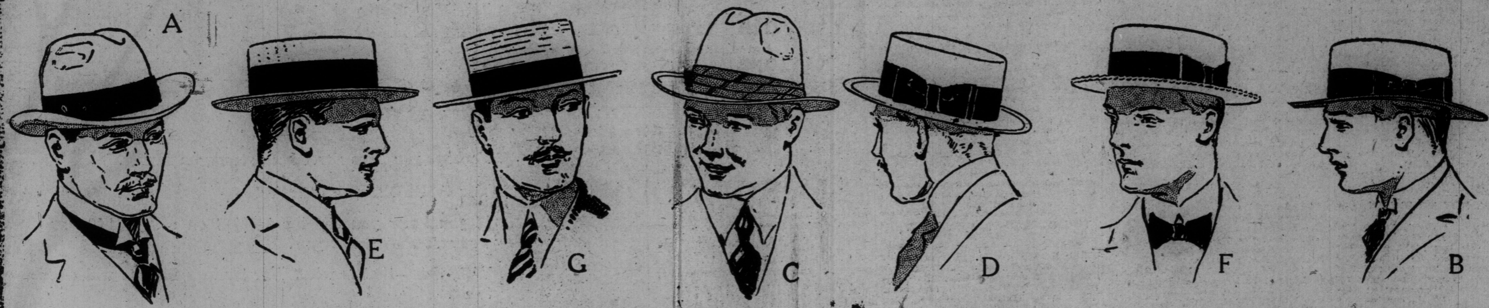
A is a Panama of finely woven South American fibre, in fedora, crease crown shape, with flaring brims. Price, $8.00.

1869 GOLDEN JUBILEE 1919 "SHORTER HOURS" "BETTER SERVICE"