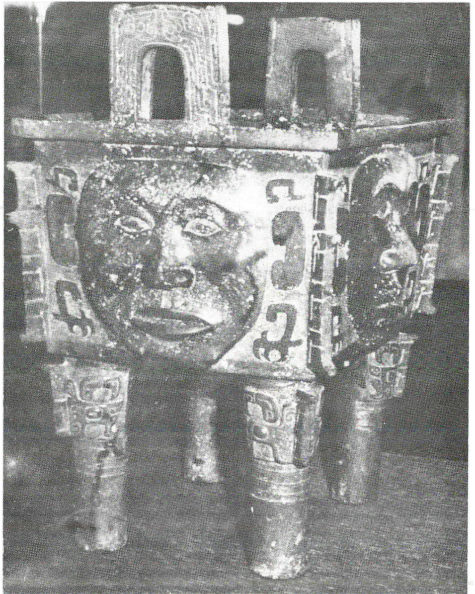
One of the interesting bronzes on display is this rectangular four-legged ritual food vessel, which has a realistic human mask in high relief on each of its four sides. The object probably

was used in connection with human sacrifice, though the significance of its unique design is not fully understood. Shang dynasty (1523-1027 B.C.)