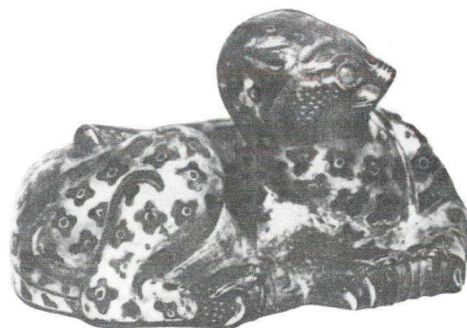
Bronze leopards inlaid with silver and gems found in 1968 in the tomb of Princess Tou Wan of the Western Han

was used in connection with human sacrifice, though the significance of its unique design is not fully understood. Shang dynasty (1523-1027 B.C.)