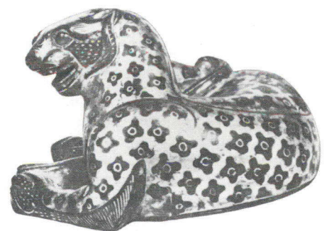
dynasty, late 2nd century B.C. They were probably used as shroud weights.