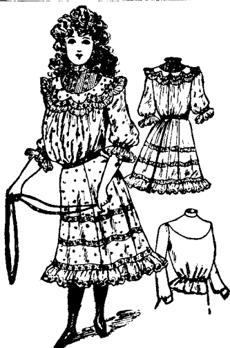
4113 Girls' Costume, 8 to 14 yrs.