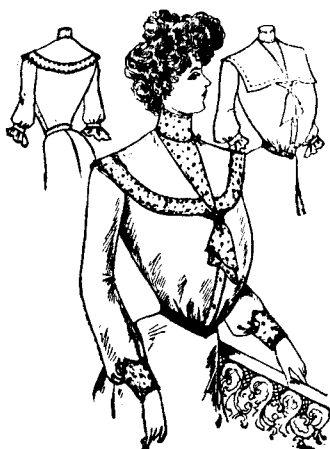
4107 Sailor Blouse, 32 to 40 bust

be black or colored velvet, ribbon, lace insertion or fancy braid, or can be omitted altogether.