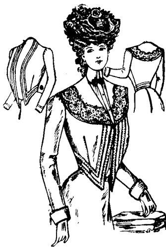
4110 Misses's Eton Jacket, 12 to 16 yrs.