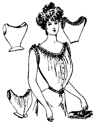
4104 Seamless Corset Cover, 32 to 44 bust.