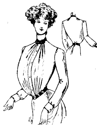
4099 Shirt Waist, 32 to 44 Bust.