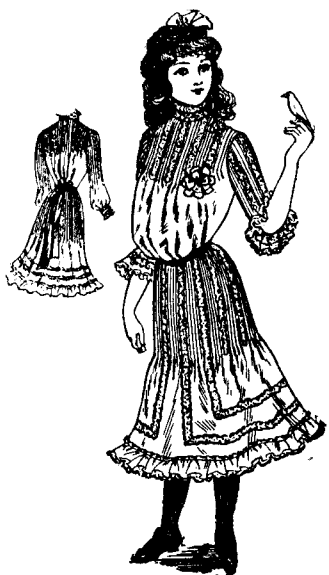
4102 Girl's Dress, 8 to 14 yrs.