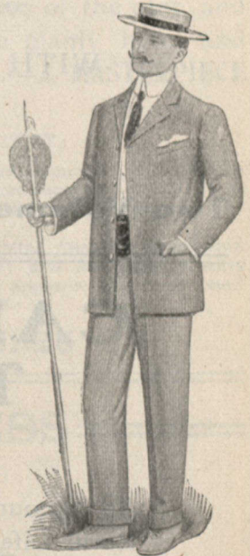
No. 10A. From $6.85.

Tweeds, New Dress Fabrics, Flannels, Linens, Cottons, Scotch Winceys, Etc.