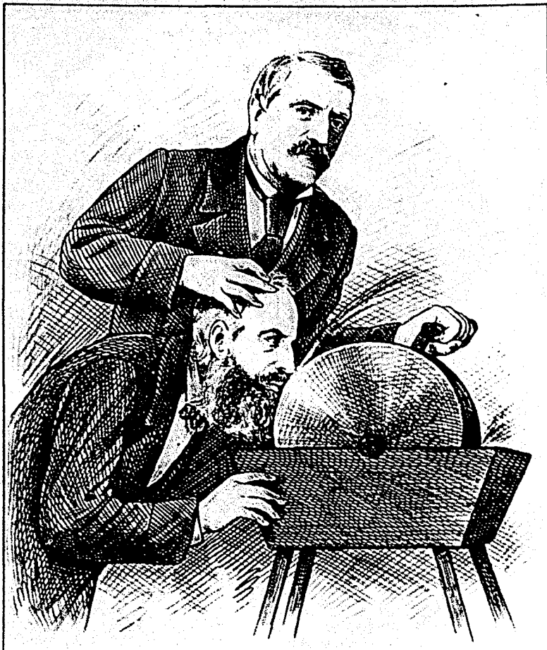
APPLYING AN OLD FASHIONED REMEDY.

dated 15th May, 1872, from an old inhabitant of Horningsham, near Warrminster, Wilts:—"I must also beg to say that your Pills are an excellent medicine for me, and I certainly do enjoy good health, sound sleep and a good appetite; this is owing to taking your Pills. I am 78 years old. Remaining, Gentlemen, Yours very respectfully, To the Proprietors of NORTON'S CAMOMILE PILLS, LONDON. 16-5-52-28