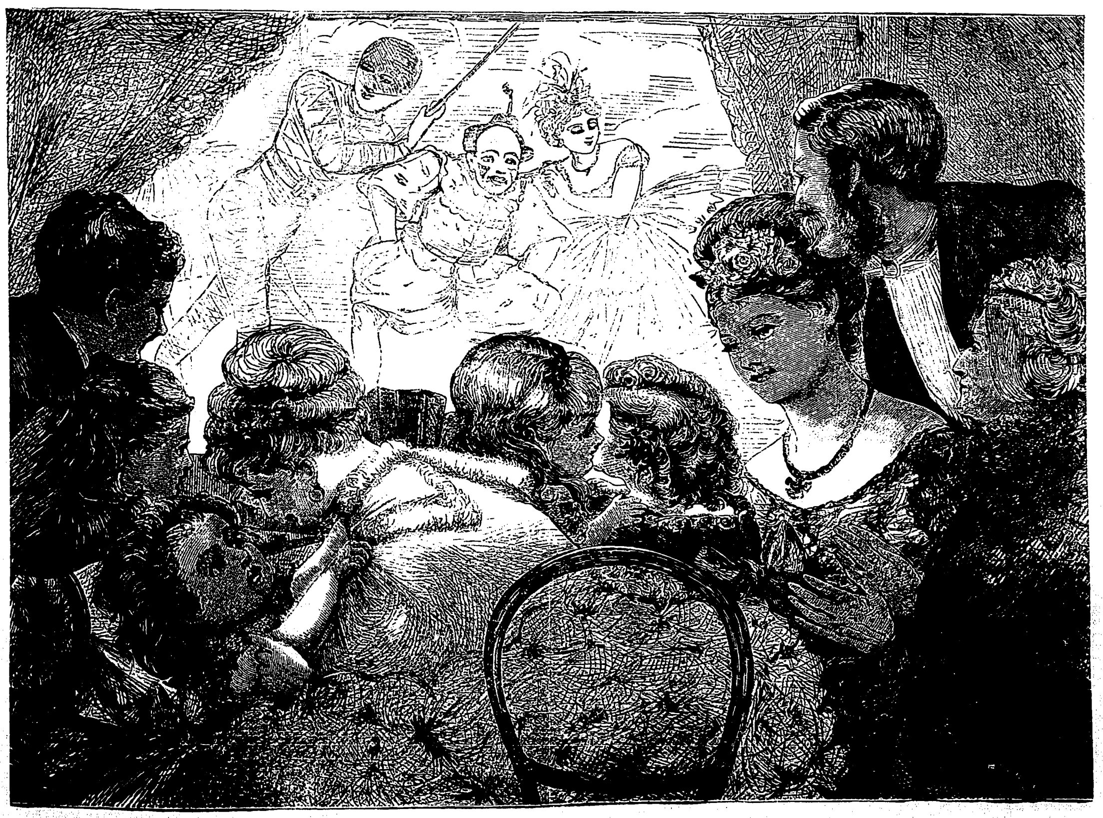
A PANTOMIME PARTY.—See page 332.

personal attachment to the Prince, called forth by his own modest and manly conduct, coupled with his kindly courtesy of manner, were not the only incentives which moved the people, though they have undoubtedly contributed much to the enjoyment of the various entertainments at which he has been present. But beyond personal considerations the Canadian people have felt and acted upon the feeling that as the son of the Queen, and there-