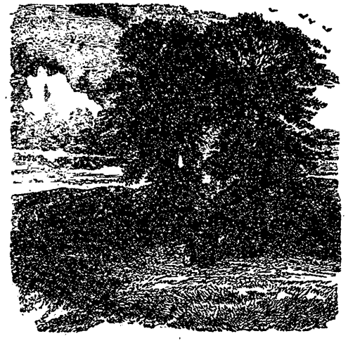
INDIAN GRAVE-MOUND, NEAR ST. ALBANS.

The great Kanawha is one of the noblest rivers of Western Virginia. Many of its storied memories are of especial interest. At Point Pleasant, where that stream en-