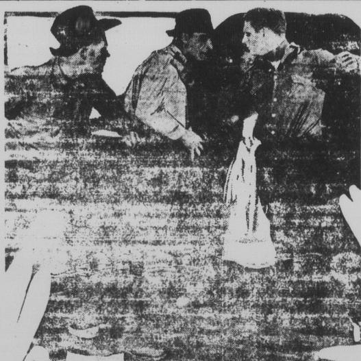
Fred Thomson in "The Fighting Sap" AT THE OPERA HOUSE FRIDAY AND SATURDAY A Whirlwind of Action! A Hurricane of Thrills!