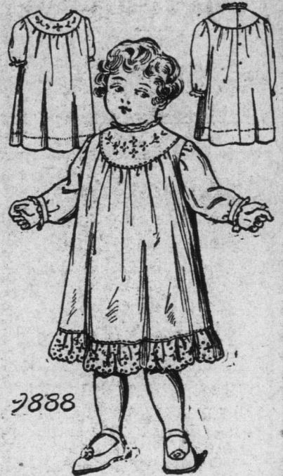
Child's Dress with Yoke and Long or Shorter Sleeve. In High or Low Round Collarless Style.

9888.—A Dainty Dress for the "TINY TOT."