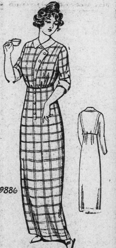
Ladies' House Dress (In Raised or Normal Waistline) with Long or Shorter Sleeve.

9886.—A PRACTICAL AND PLEASING HOUSE OR HOME DRESS.