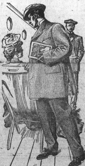
Copyright 1905 by Hart Schaffner & Marx