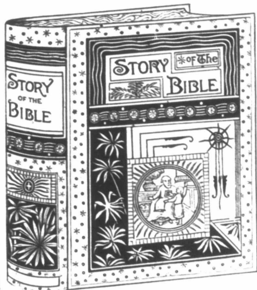
Size, 9x7 1/2 inches; weight, 4 lbs.