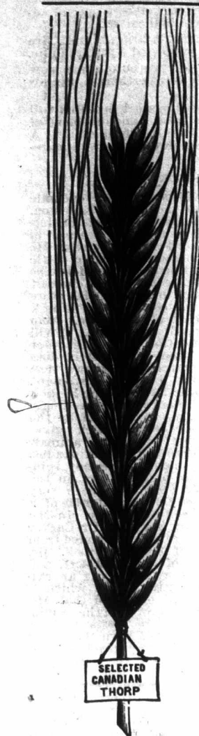
SELECTED CANADIAN THORPE

We also call your attention to the page of premiums on page 19, January 1st, and page 39, January 15th issues. Everyone is delighted with them.