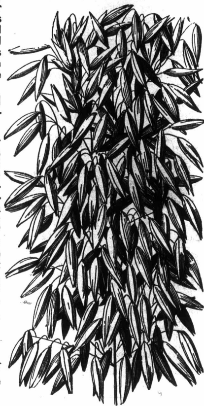
THE WHITE MONARCH OAT.