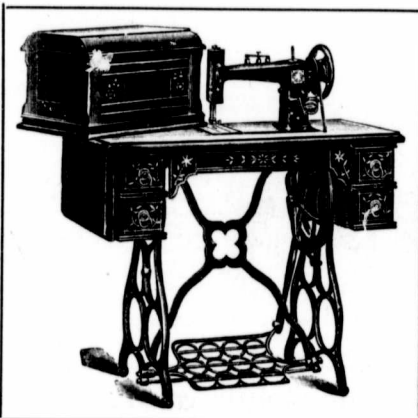
Cabinet No 2

Same as No. 1, without drop head, but with neat protecting hood.