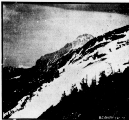
EMPIRE MOUNTAIN, SHOWING CABINS AND CLAIMS IN FOREGROUND, TROUT LAKE DISTRICT.