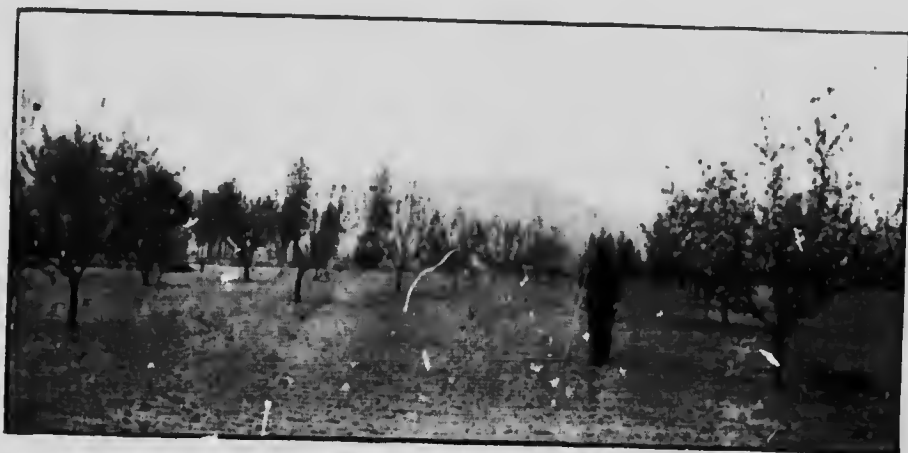
YOUNG ORCHARD, GRAND FORKS, B. C.

R ealizing the possibilities resulting from scientific development of raw lands in the Salmon Arm district of British Columbia, this Company has been incorporated for the purpose of dealing with specified holdings in this locality, adopting and pursuing methods which have proven successful in other localities possessing, to some degree, the same advantages and necessary qualifications which are found in Salmon Arm, viz.: Proper climatic conditions, formation of soil and precipitation of moisture, etc.