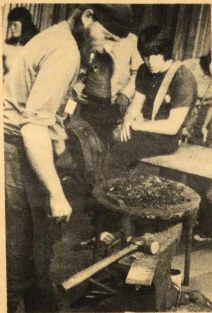
A Blacksmith at work

The drama of the missing sheep provided the Festival organizers with a great deal of somewhat