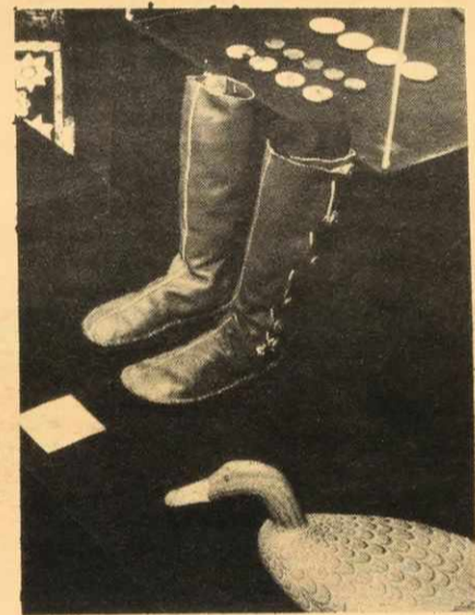
Leather work, Juried Craft Exhibit

Among the highlights of the Festival were a Jazz Band on the Halifax - Dartmouth ferry, a Juried craft show in the Sculpture Court of the Dalhousie Arts Centre, a flea market - also at the Arts Centre, a massive craft show and sale at the Dalhousie Rink, films for all ages and mostly free, and numerous