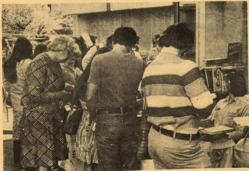
The Flea Market