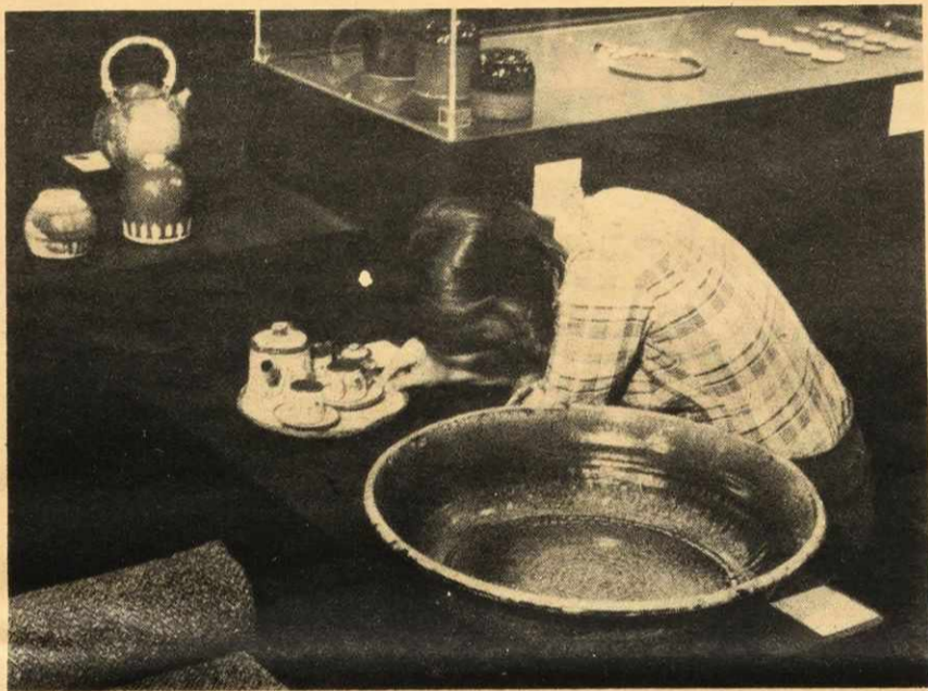
A pottery workshop

The Festival of the Arts was for the most part a great success and provided a good way for the citizens of Metro to finish off the summer and perhaps do a little early Christmas shopping.