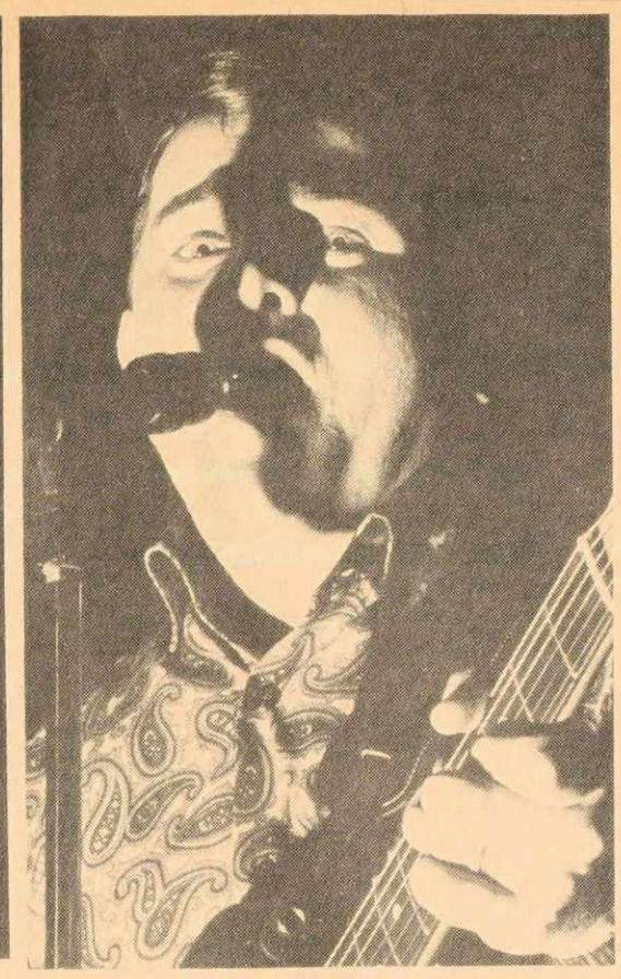
Go-go girl at left "works out" in front of 800 people at the men," who now have been replaced by "The Axemen," who Saturday night King's Dance. Above are pictured "The Fender- have recently acquired, amongst other things, an organist.