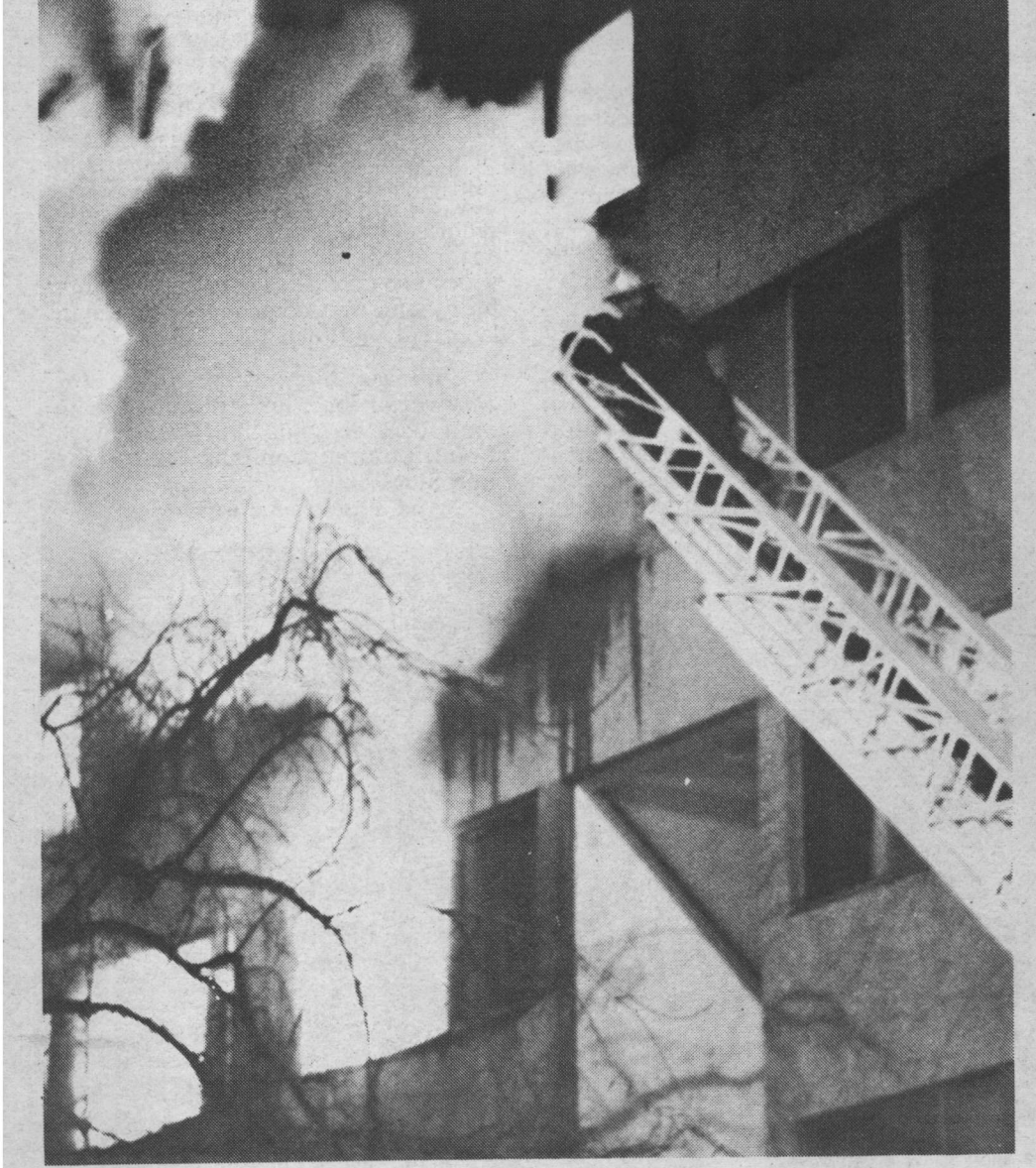
The HUB fire