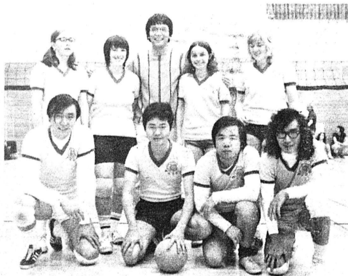
Winners of the Co-rec volleyball title: Chinese Students Association

Friday Bearcats downed South Side Metros 7-3. Jr. Bears are now tied for first place with Metros in the E.M.J.H.L. 'Cats boast a 9-1-1 record while South Side has 9-3-1. ac