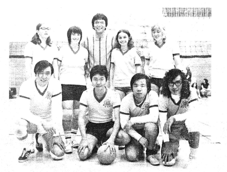
Winners of the Co-rec volleyball title: Chinese Students Association

Friday Bearcats downed South Side Metros 7-3, Jr. Bears are now tied for first place with Metros in the E.M.J.H.L. 'Cats boast a 9-1-1 record while South Side has 9-3-1.