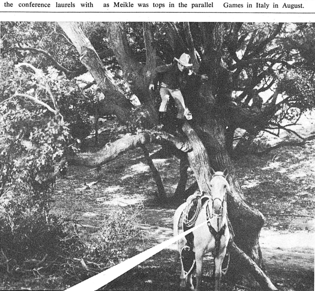
The Studentbank closes in 5 minutes and this idiot's got to prove himself!

The individual winners will represent Canada in the World Student Games in Italy in August.