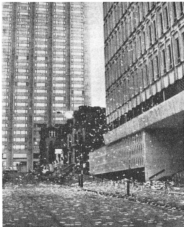
IBM CARDS DANCED IN THE AIR ... and Sir George is quiet—now

MONTREAL (CUP) — A hard line on university security was announced by the Sir George Williams administration Thursday night as students and administrators headed into the long mopping-up procedure following Tuesday's 10-hour and $2 million eruption.