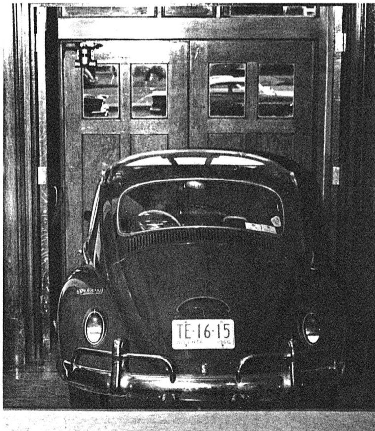
ONE SOLUTION . . . ... to the almighty parking problem

The real problem is not that democracy is denied the students in their union — the leaders know that wide-spread support means progress — but the students just don't care to do their job.