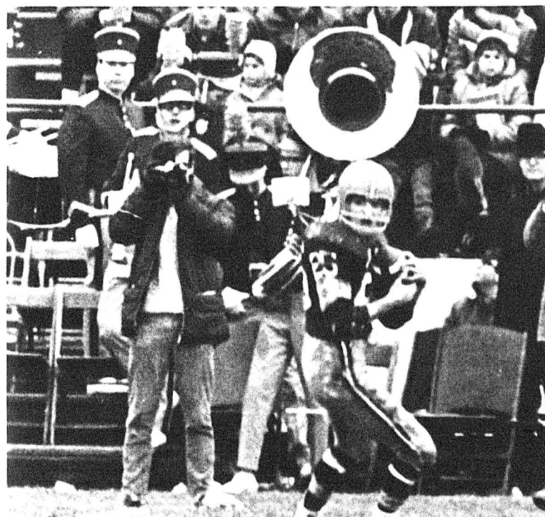
1500 Was in A last in 1 14