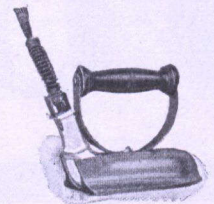
3-pound Flat Iron for Sewing Room or Nursery

The heating and cooking appliances designed and manufactured by the Canadian General Electric Company mark a new epoch in domestic science in that they employ electricity to generate heat with absolute reliability and (when properly used) with excellent economy. They are SAFE even in the hands of the unskillful, and are practically INDESTRUCTIBLE.