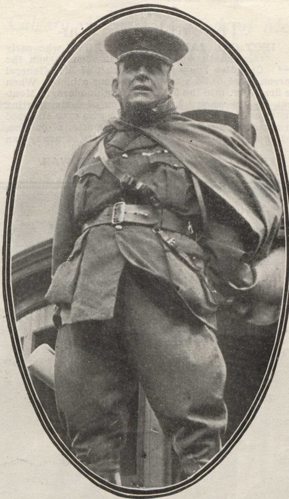
The way Major-General Sam Hughes felt after he had seen the first C.E.F. off for England down in the Gulf of St. Lawrence.