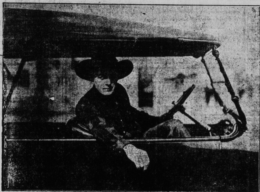
Harry Carey, popular Universal Western Movie Star, drives a big seven-passenger Studebaker, similar to the one offered as first prize in The Standard's Auto and Movie Star Contest. Here he is at the wheel of his Studebaker. Two of the prizes to be given away in the Standard's big Auto and Movie Star Contest are Opportunities to become Movie Stars with The Universal Film Company of Universal City, California.

The automobiles which will be given away in connection with The Standard's big $15,000 Prize Contest will not be driven around the country or city by members of the Contest Department or any other persons. We are giving away NEW cars in this contest—not second-hand machines.