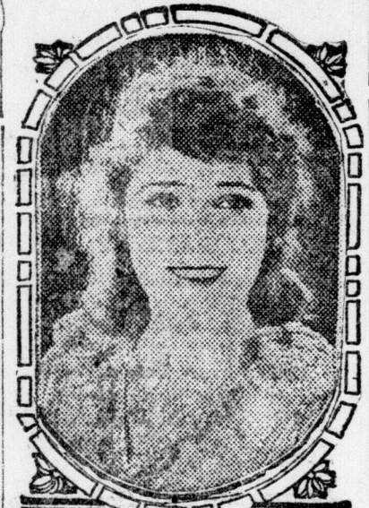
Mary Pickford in "The Hoodlum"