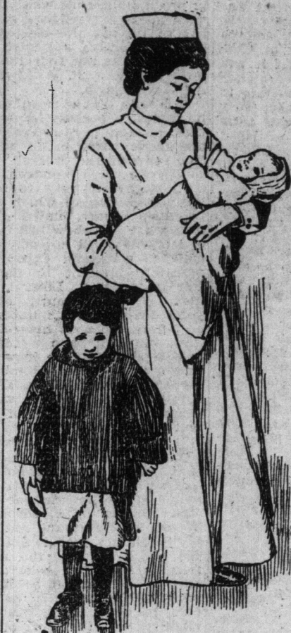
TWO OF NURSE'S PETS.

That your Dollar may be a light in the darkened childhood of some sick or crippled little one.