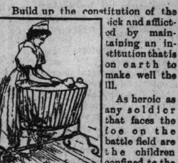
FEEDING A BABY. Hospital for Sick Children.

A course of treatment in the Hospital is the interval between shadow and sunshine in a child's chequered life.