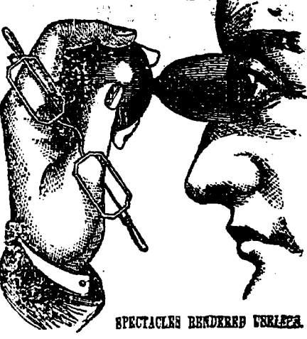
SPECTACLES RENDERED USELESS.