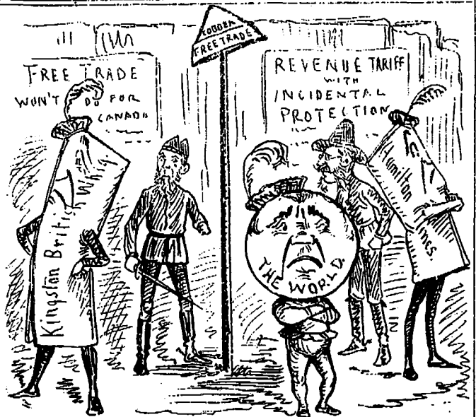
THE LIBERAL WILLIAM TELLS REFUSING TO BOW ANY MORE TO THE COBDEN HAT.