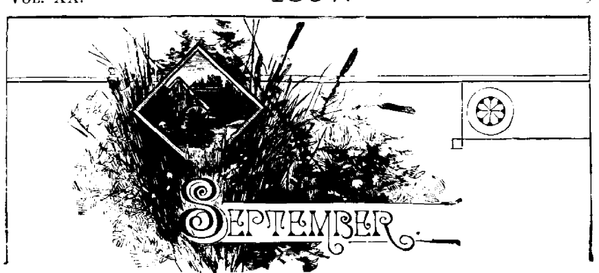
THE GRIMSBY HORTICULTURAL SOCIETY.