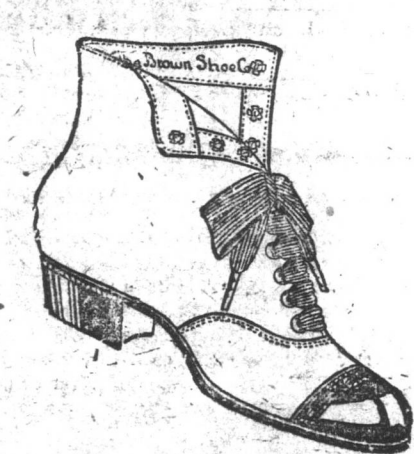
Women's Heavy Pegged Boots. Boys' Heavy Laced Boots. Youths' Heavy Laced Boots. Men's Heavy Laced Boots. Girls' Heavy Laced Boots.