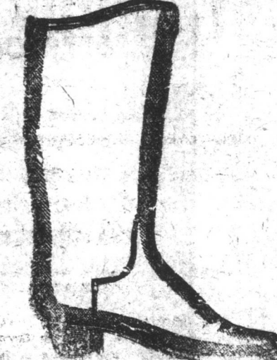
Hand-made Tongue Boots. Wellington Tongue Boots.

Besides being more easily repaired, they are more comfortable than Rubber Boots. We admit you can buy Rubber Boots for less money than Leather Boots, but in the end they are far more expensive.