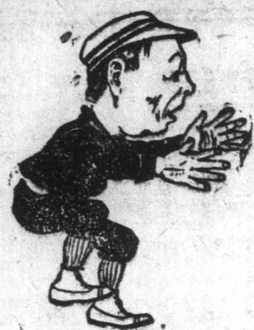
THE BIG CLASH.

On to-morrow afternoon at 2.30 o'clock the much talked of Junior ball game will be played on St. George's Field. The youngsters are most enthusiastic over the game, and as these are our future ball players we ask the fans to be present to cheer them on. The game will be five innings, and will begin sharp on time in order that there may be no delay in starting the big clash between the B.I.S. and Cubs, which is scheduled for 3.30. This promises to be one of the most interesting games of the series. Both teams are in good shape, and each is confident of winning the game.