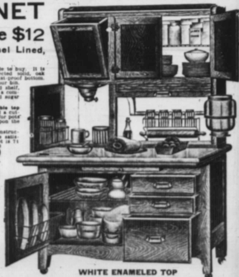
WHITE ENAMELED TOP

100 ft. 7 in. 4 ply $28.50 100 ft. 8 in. 4 ply $34.50 100 ft. 9 in. 4 ply $40.50 100 ft. 7 in. 5 ply $34.50 100 ft. 8 in. 5 ply $41.00 100 ft. 9 in. 5 ply $47.50