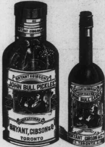
This is a facsimile of our bottles. "Worcestershire Sauce," "Yorkshire Sauce" "Devonshire Relish" Raspberry Vinegar, Eva- porated Vegetables, Chocolates, Cocoas, Confectionery.

BRYANT, GIBSON & Co., TORONTO, Manufacturers of