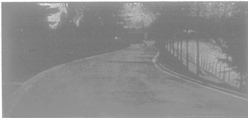
Government Parkways, Ottawa, Canada. Treated with "Tarvia-B."

THE CARRITTE-PATERSON MANUFACTURING CO., LIMITED ST. JOHN, N.B. HALIFAX, N.S. SYDNEY, N.S.