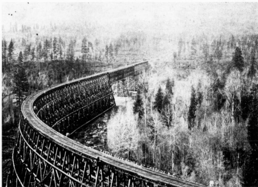
KETTLE RIVER BRIDGE AT CASCADE, B. C.

river and about 4,000 feet above sea level, this being the highest altitude attained along the line. From Summit to Cascade, at the foot of Christina lake, the distance is 24 miles and the general direction southerly. On this long descent into the valley of the Kettle river the line passes through the Burnt basin, in McRae pass,