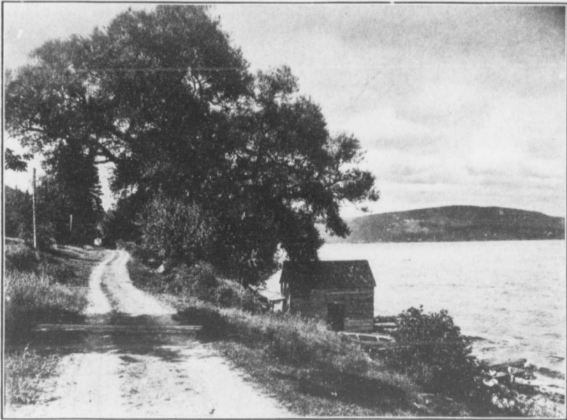
The Shore Road and Digby Gap