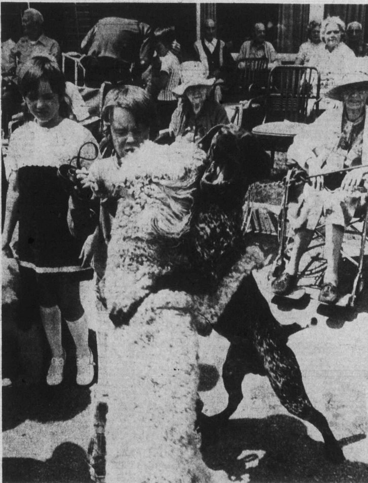
Everyone else was much too warm during entertainment for seniors at Extencare on Queensway last week but these two canines tried to upstage the performers with their own brand of antics.