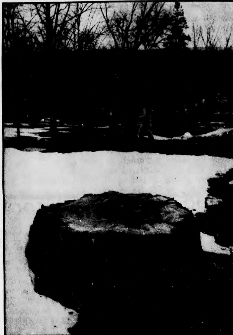
STUMP—Seen here is one of the strange phenomena created by our dreaded budworm plague. This specimen, outside Memorial Hall on the U.N.B. campus, shows how the bugs work.