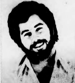
April 2nd - 8:00 a.m.