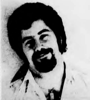
April 1st - 8:00 p.m.