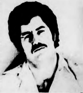
April 1st - 8:00 a.m.