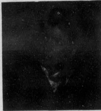
Ed. 2 Brenda MacLeod Staff Lib.

Good question! Spend it to straighten out the SRC?