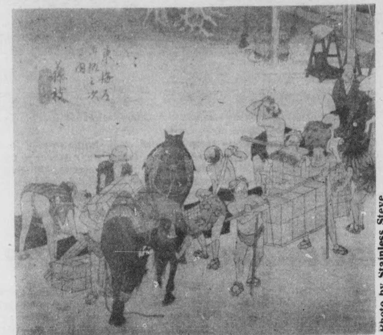
This is a sample of the exhibit currently on display at the Beaverbrook Art Gallery, "The Fifty-Five Stations of the Tokaido". This series consists of woodblock prints by a nineteenth century artist, Utaguwa Hiroshige. Related films will be shown Oct. 15 by the Japanese Embassy.

Any ancient Germanic-type person who would like to join we Angles, (not Angels) and our revels, come along to our next meeting on October 22nd, or And perhaps we will even have our contact 'the chief', Department of