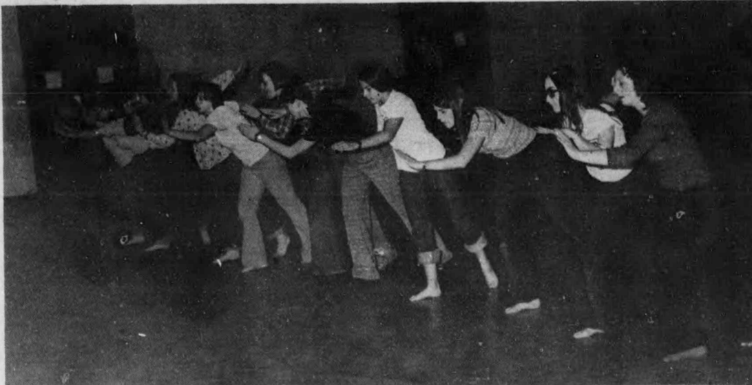
Here we see the third year nursing students practising their charleston routine.

With only the finishing touches left in the making of a show that has taken over a year to put together, Red 'n Black '74 goes on stage at the Playhouse, Nov. 12, 13, and 14. Tickets are on sale beginning today at the SUB Info Desk for the low, low price of $2.00. This is one Red 'n Black you will not want to miss. Get your tickets soon. These tickets sell-out very quickly!