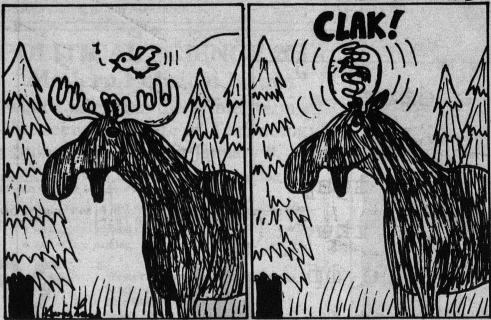
THE MOOSE-VENUS FLYTRAP HYBRID