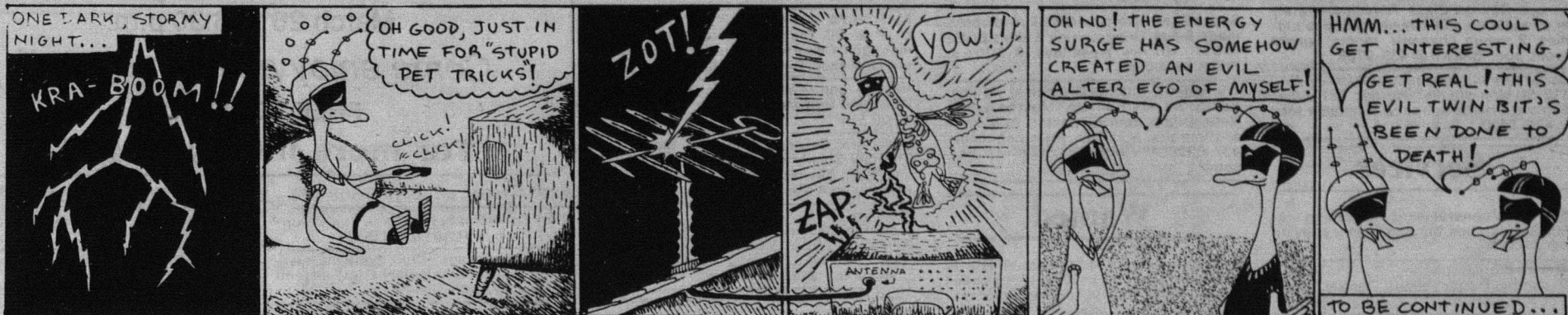
The Warped Strip