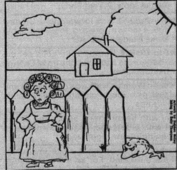
Little Bo Peep has lost her Gila Monster