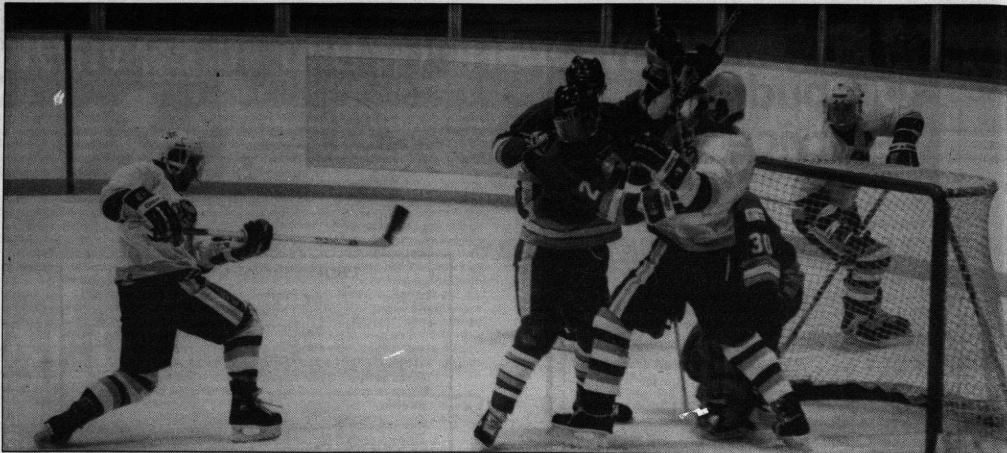
Couldn't resist running just one more hockey picture. Force of habit, I guess. Craig Dill scores against Calgary.