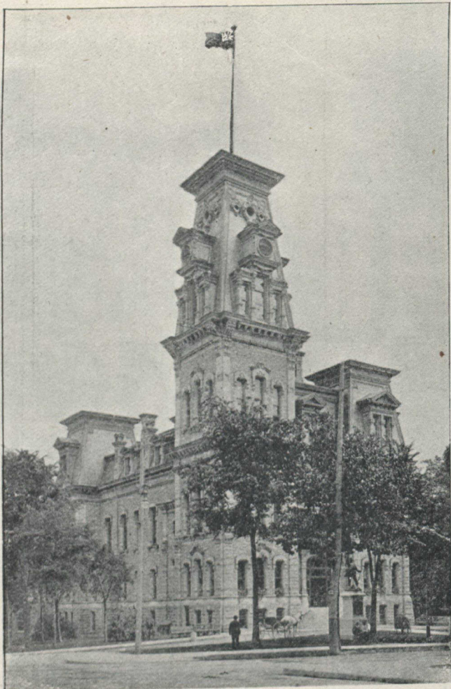
Ottawa City Hall.

and put up the finest line of celebration that the world has ever seen—at least that's what her loyal citizens are declaring. Many years ago she had a winter carnival; it followed similar events elsewhere and went them all one better. Now she proposes to repeat the experiment and put up a summer carnival that will out-class all predecessors. In her civic life, too, she has reached the half-century mile-stone; she proposes, therefore, to include in her programme an observance of this, her semi-centennial civic jubilee, and lastly, to her sons and daughters scattered the wide world over, she has sent forth in thousands, a warm hearted personal invitation to come home, and—they're going. Going from everywhere—from Australia, New Zealand and the Isles of the Southern Seas, from China, Japan and sunny India, from historic South Africa, where shoulder to shoulder with their compatriots from every part of the Dominion and many parts of the Empire, her sons fought, and unhappily, not a few of them died, from every State of the Union and from every province of the Dominion they are going—they have heard the call, they have sent the response, and they will be there.