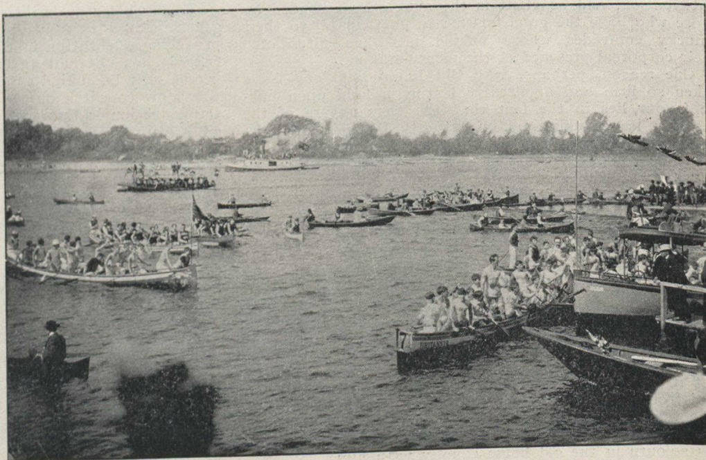
War Canoes in the Ottawa.

An interesting feature of the week is a cricket tournament between picked teams from half a dozen cricket centres, including Halifax on the one hand and Victoria