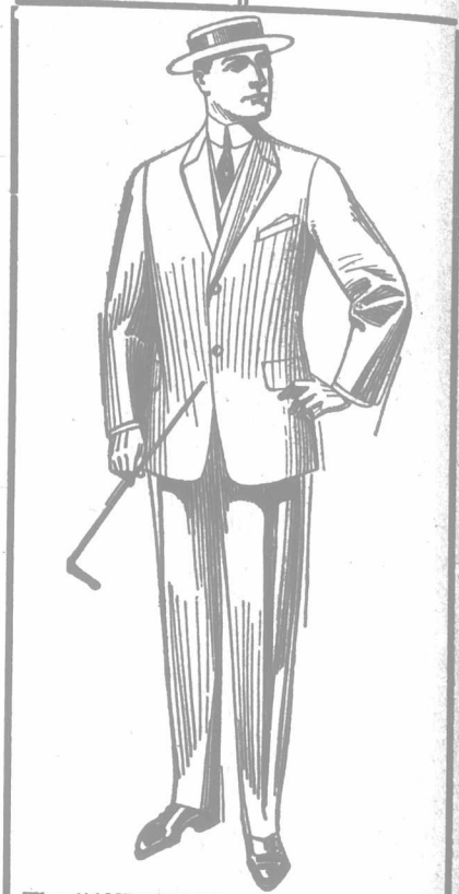
The "ANDOVER" is the fashionable type of single-breasted, two-button suit that is now being worn extensively in London and New York. You will be delighted with it.