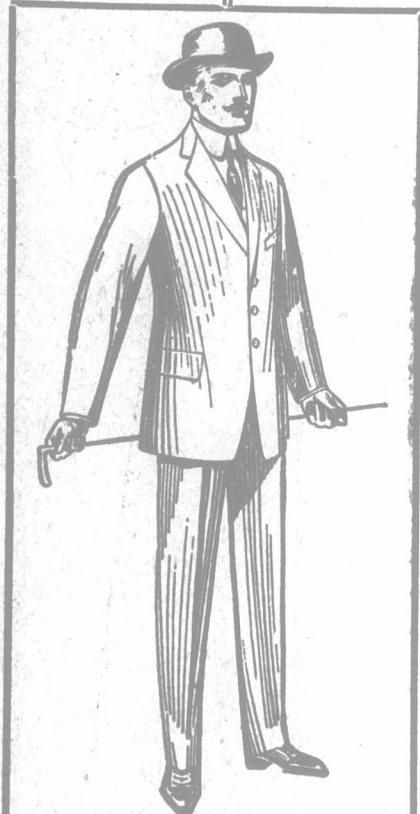
The "BURLINGTON" English Model. This shows the most popular style of suit worn by well-dressed men in England.

Fill out and mail this coupon to-day, and get 72 pattern pieces of the finest English suitings you ever saw. If you don't want to cut your copy of the Advocate, write a post card or letter, and we'll send you the samples just the same—but to get them you must mention London Farmer's Advocate.