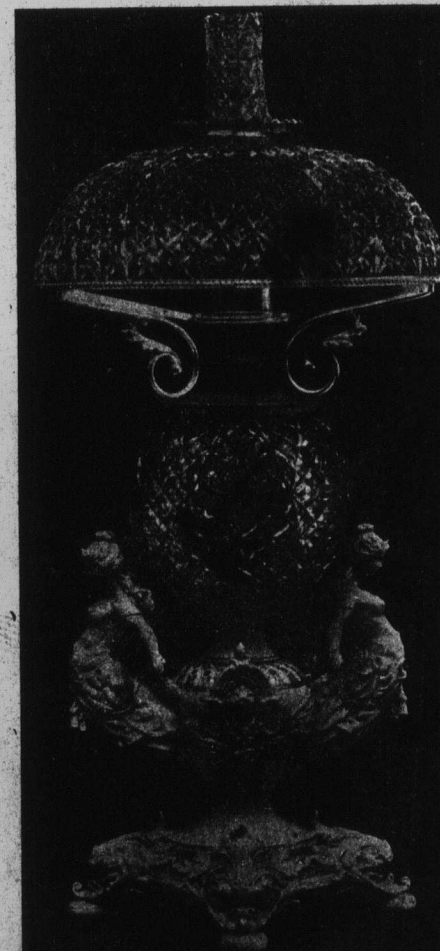
THE BEAUTIFUL LAMP,

party patronage began to be clamored for. The printing of the reports began to be taken away after the blanks had disappeared, until but one report—that of auditors—remained to be done in the office beside the issuing of the Gazette. It is likely that Wilmot's Park was planned and laid out